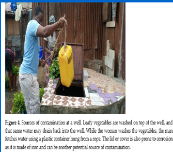
Figure 4. Sources of contamination at a well. Leafy vegetables are washed on top of the well, and that same water may drain back into the well. While the woman washes the vegetables, the man fetches water using a plastic container hung from a rope. The lid or cover is also prone to corrosion as it is made of iron and can be another potential source of contamination.