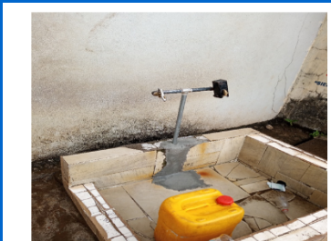
Figure 6. A typical example of one of the standpipes in Brookfields connected to the pipe network. The tap is closed after use by the people.